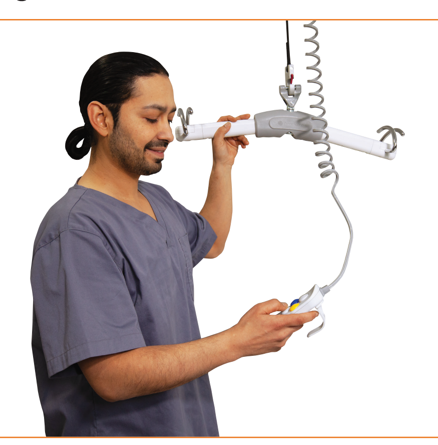
Bull Horn Connector